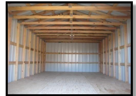
Interior of 12x20 Gable Shed with optional snow load truss