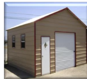
Metal buildings: Carports, RV covers, Garages