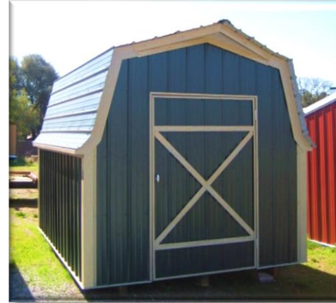
9x12 Gambrel Barn