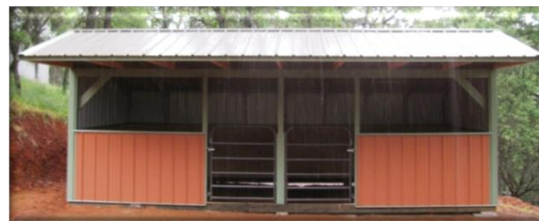
2 12x12 stalls; 6' overhang; 4' gates