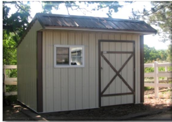
9x12 Saltbox * Window option not included