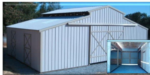
36x24 Raised-aisle barn; sliders; Dutch –doors Inset – interior of barn.