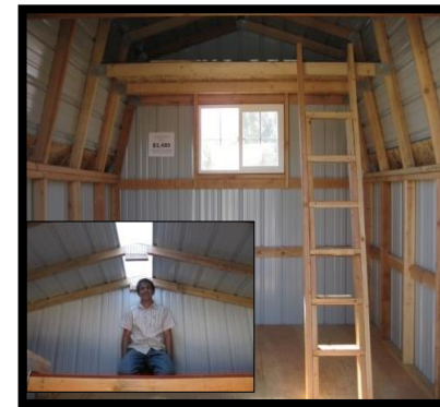
Interior of 9x12 Gambrel Barn with optional loft, ladder and window. Inset – loft in 12x