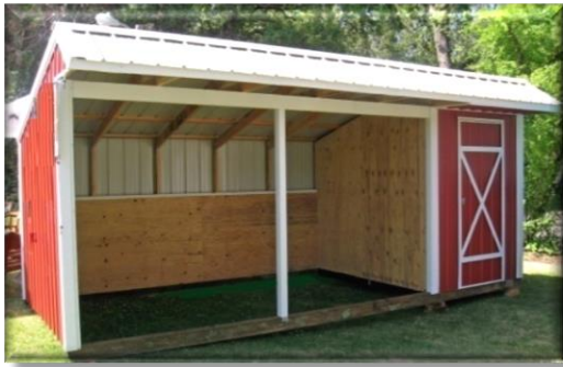
9x21 MUS * 6' storage room standard feature