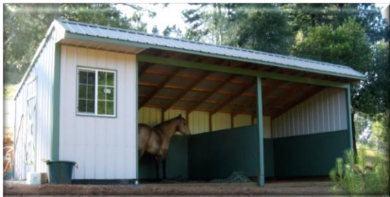
12x30 with optional stall divider and 3x3 window