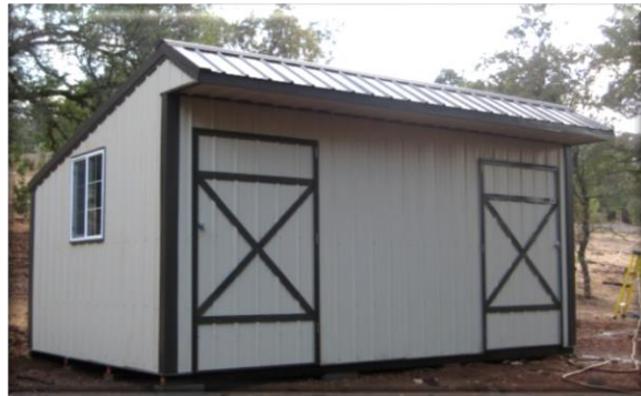
12x18 with optional 2 nd door and 3x3 window