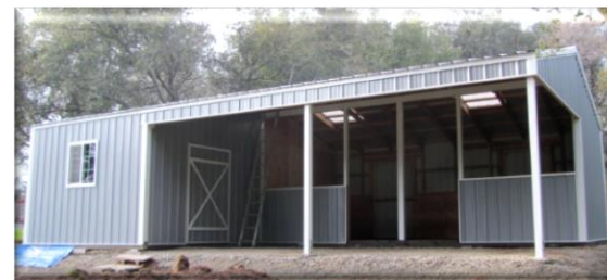
24x36 Barn (12x24 storage; 2 12x12 stalls; 12x24 overhang; stall enclosures and sliders)