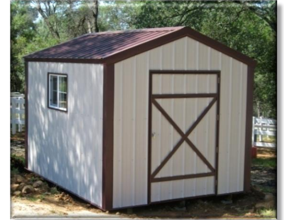
9x12 Gable Shed * Window option not included